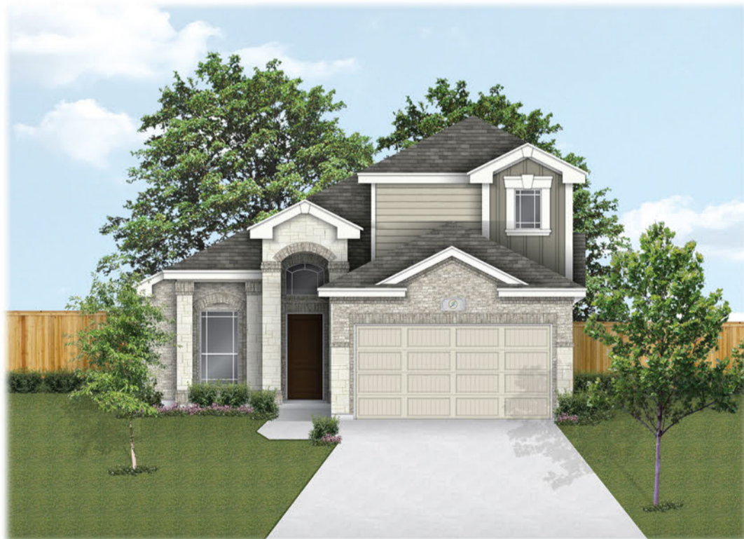
elevation - B