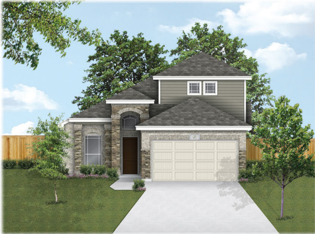
elevation - A

3 Bedrooms • 2 Baths • Game Room • Study Open Kitchen/Family Room • Covered Patio • 2 Car Garage